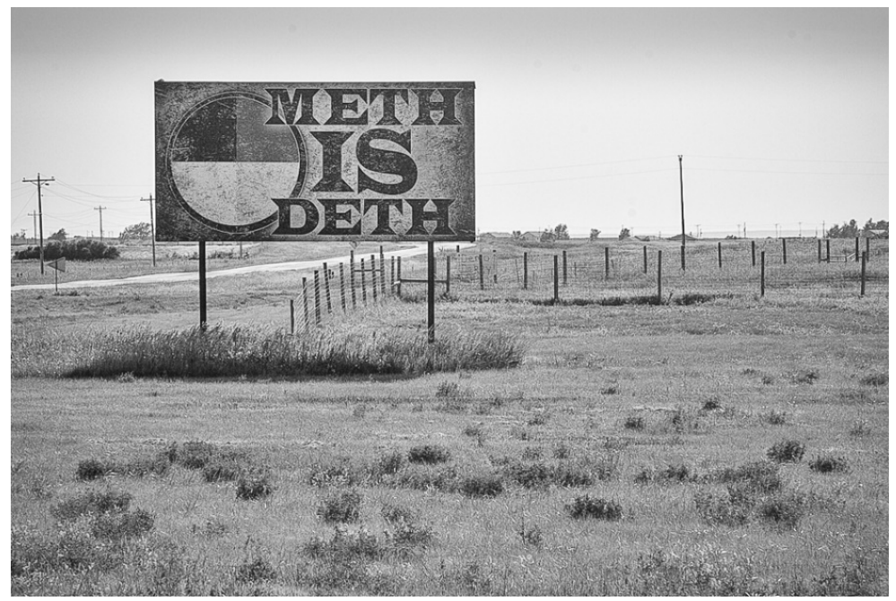
Meth is Deth Sign on Lower Brule Reservation, South Dakota, 2009

Note: This photograph and discussion are suggested for older students.